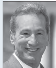
TOM AMMIANO D – SAN FRANCISCO