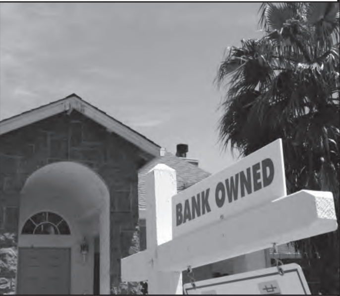
SB 729 WOULD HAVE SAVED MANY FAMILIES FROM LOSING THEIR HOMES AND HELPED STABILIZE HOME VALUES BY ELIMINATING THE PRACTICE OF FORECLOSING ON A HOME WHILE A FAMILY IS IN THE LOAN MODIFICATION PROCESS.