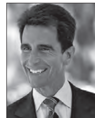
MARK LENO D – SAN FRANCISCO