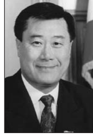
LELAND YEE D – SAN FRANCISCO/ SAN MATEO