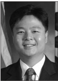
TED LIEU D – TORRANCE