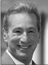
TOM AMMIANO D – SAN FRANCISCO