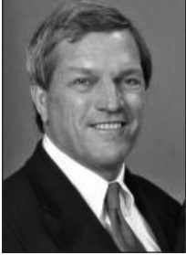
MARK DESAULNIER D – CONCORD