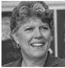
JULIA BROWNLEY D - SANTA MONICA