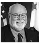
JIM BEALL D - SAN JOSE