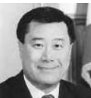
LELAND YEE D - SAN FRANCISCO/SAN MATEO