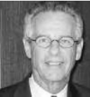
ALAN LOWENTHAL D - LONG BEACH