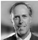
JARED HUFFMAN D - SAN RAFAEL