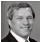
MARK DESAULNIER D - MARTINEZ