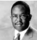
MARK RIDLEY-THOMAS D - LOS ANGELES