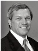
MARK DESAULNIER D - MARTINEZ