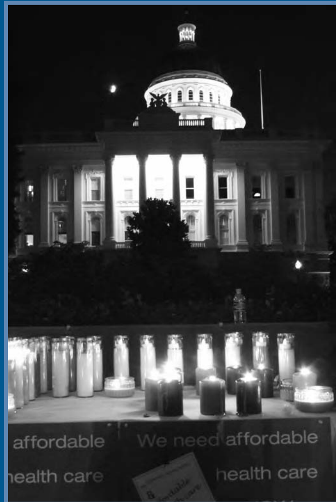
VIGIL FOR HEALTH CARE REFORM SACRAMENTO, CA OCTOBER 2007