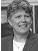
JULIA BROWNLEY D - SANTA MONICA