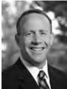
DARRELL STEINBERG D - SACRAMENTO