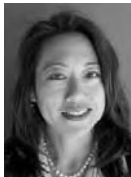
FIONA MA D - SAN FRANCISCO