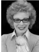
CAROLE MIGDEN D - SAN FRANCISCO