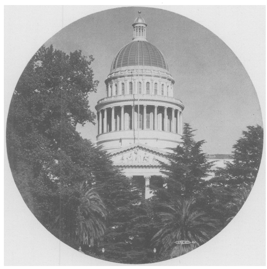
State Capitol, Sacramento Scene of Fifty-fifth Session of State Legislature